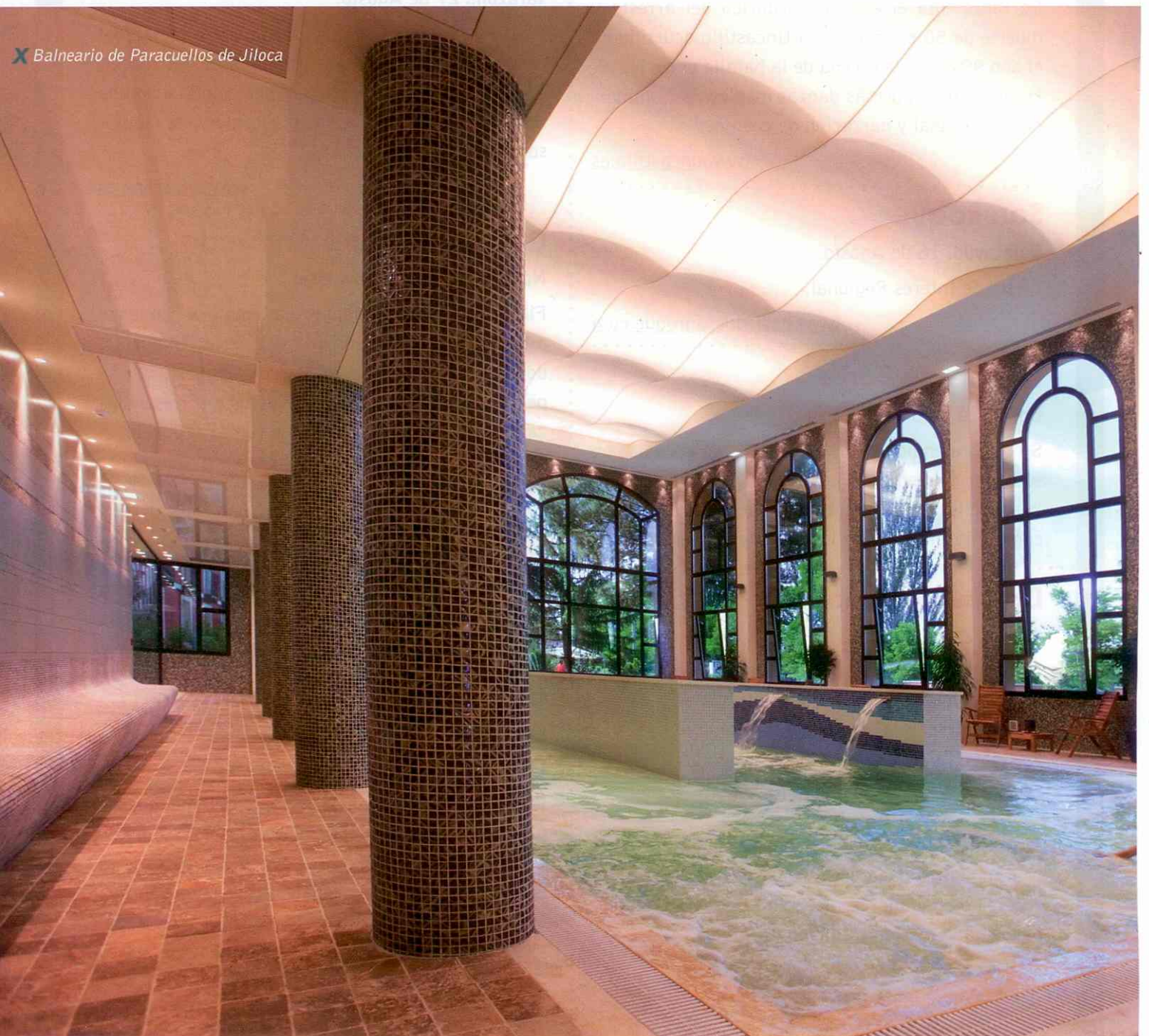
X Balneario de Paracuellos de Jiloca